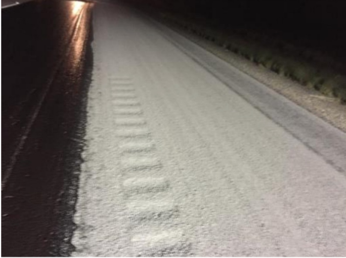
Scrub Seal night application