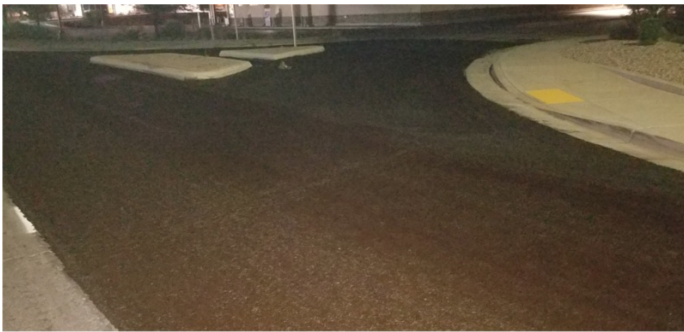
Micro Surfacing type iii aggregate