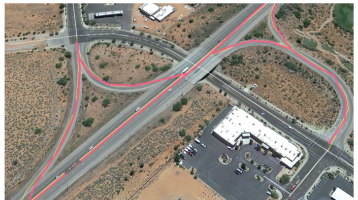
Ramps before construction