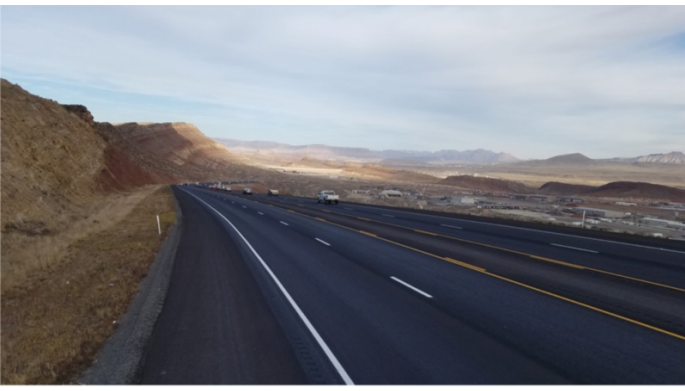
Completed Micro Surfacing