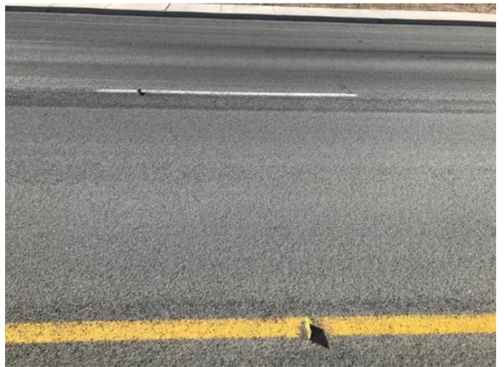
Completed Scrub Seal