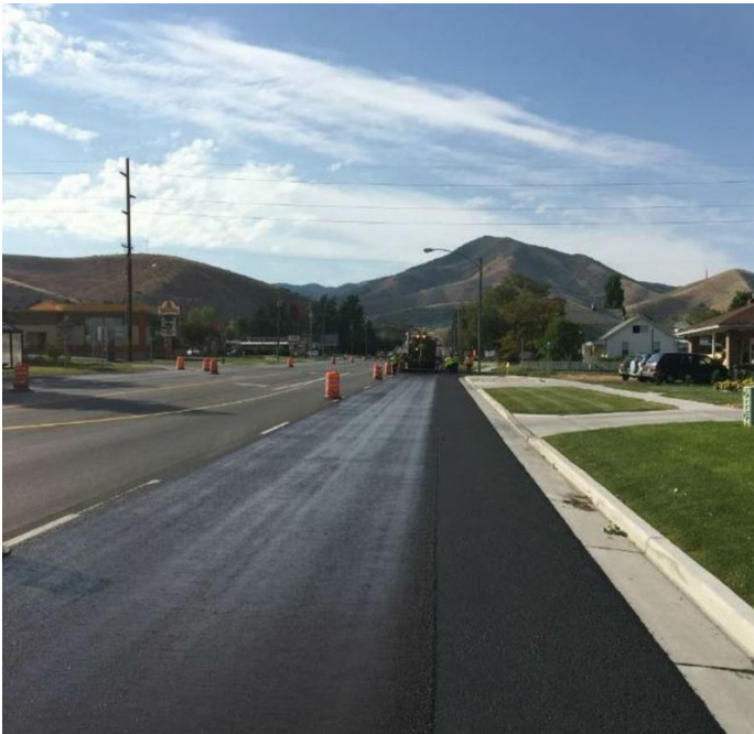
Micro Surfacing Application Intermountain Slurry Seal