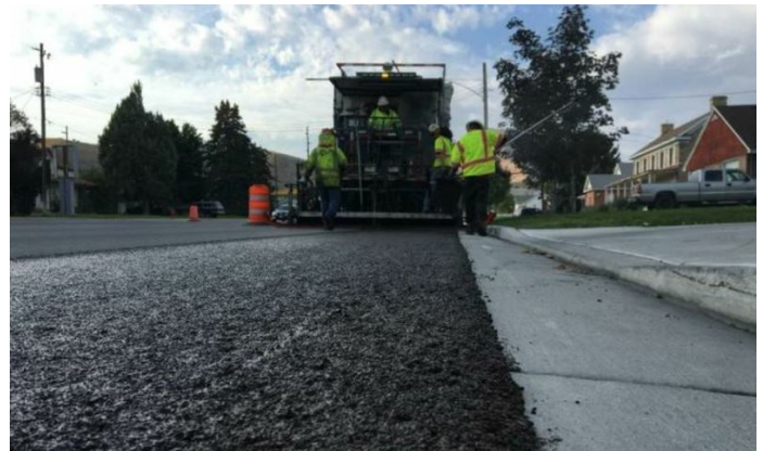
Micro Surfacing Application by Intermountain Slurry Seal with Bergkamp M1E Continuous Paver