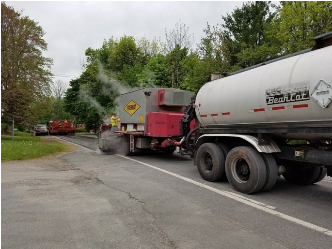
The Gorman Group laying interlayer fiber reinforced system