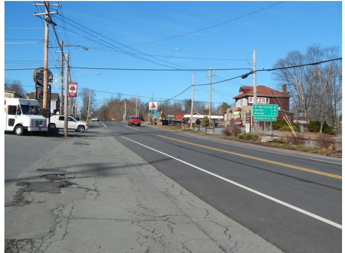
Lake Louise Marie Road finished with PPST Type B