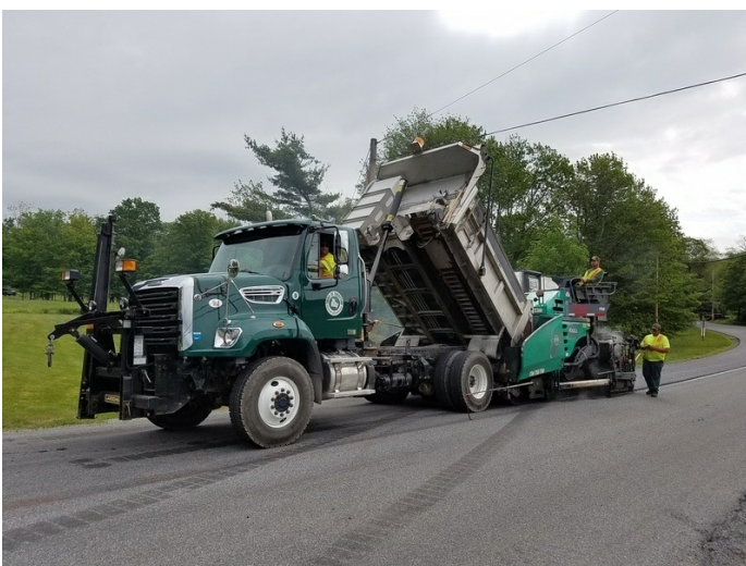
The Gorman Group paving with PPST Type B, utilizing the Town of Thompson to haul material