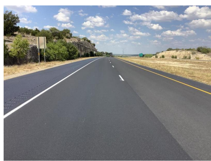
Completed Micro Surfacing project in Ozona, Texas maximized surface friction.